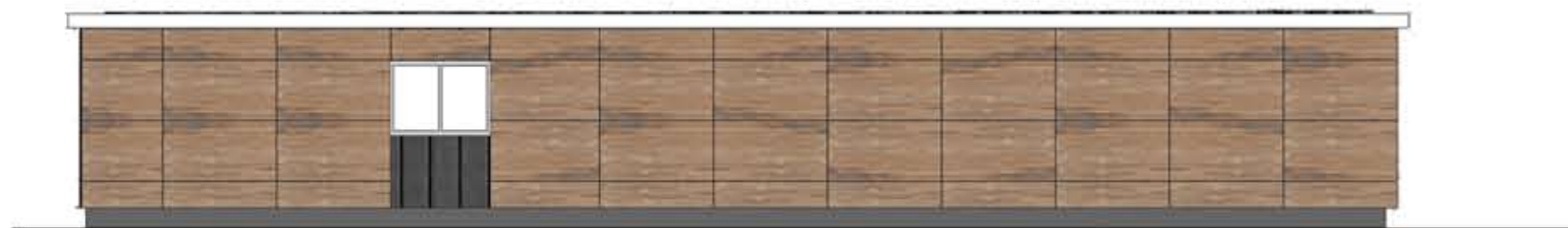
West / Rear Elevation - Scale 1:100 @ A2