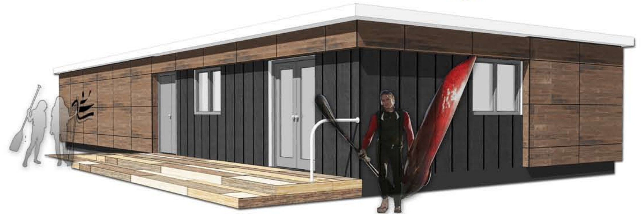
Proposed Club / Visual