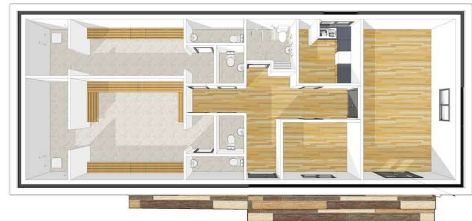
Proposed Floor Plan Visual - Scale 1:100 @ A2