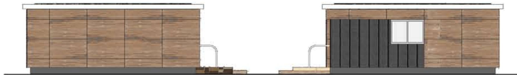
South / Side Elevation - Scale 1:100 @ A2