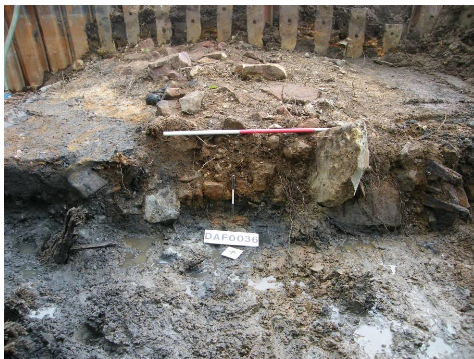
Plate 6 Section through robbed-out rubble foundation 0036 with post alignment 'F' immediately to the west, Area 02