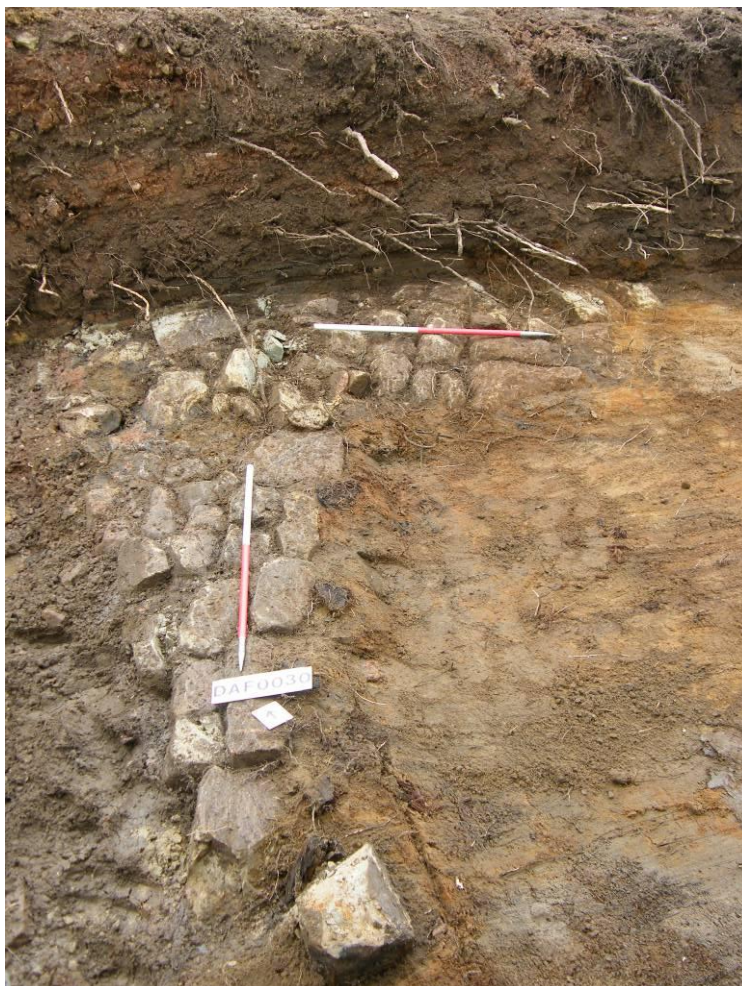
Plate 1 Linear stone foundation or packing (0030), Area 02