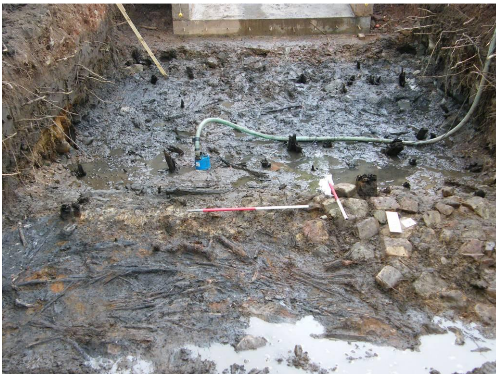
Plate 3 Brushwood 0035 (foreground) with linear stone foundation or packing (0033) and post alignments 'A' 'B', 'C', 'D' and 'E' Area 02