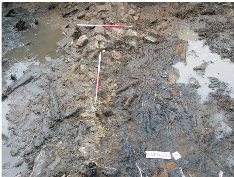
Plate 2 Brushwood 0035 partially overlying linear stone foundation or packing (0033), Area 02