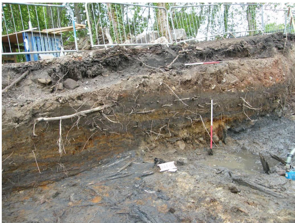
Plate 4 North facing section of Area 02 showing layers of flood deposits stone foundations