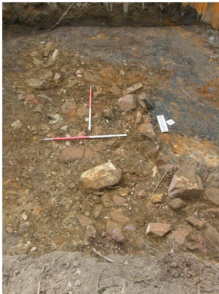
Plate 5 Linear stone rubble foundation/packing 0036, Area 02