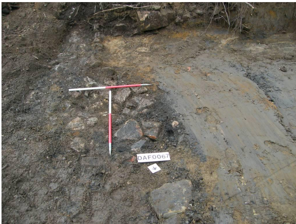
Plate 7 Linear stone foundation or packing 0067, Area 02