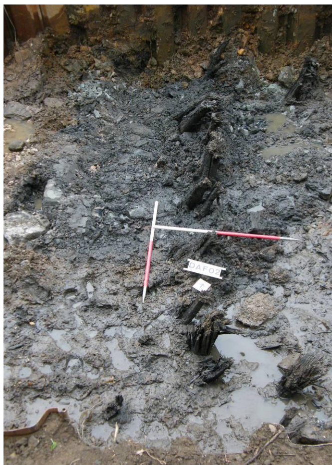
Plate 8 Post alignment 'F', Area 02