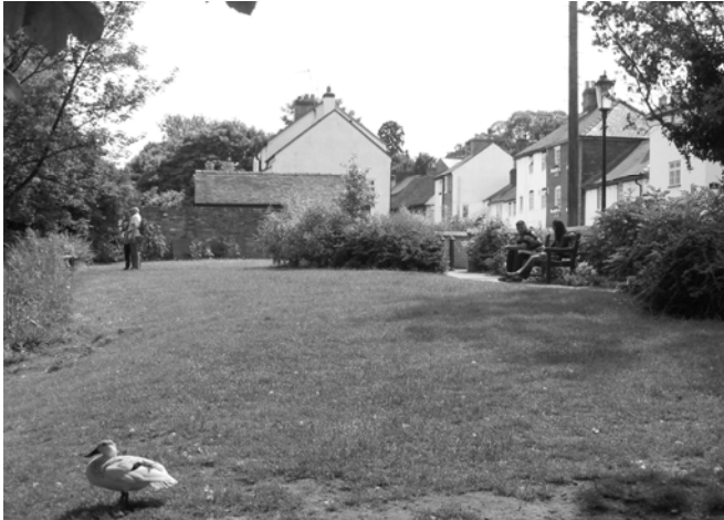
Mill View Garden – one of the sites for the interpretation boards

If anyone had told us that it would take 5 years to apply for a grant, produce 5 information boards and 2 sets of leaflets and have the boards installed, we would not have thought it possible. Nevertheless, we are almost there!